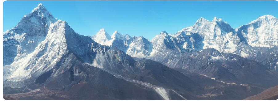
Himalayas mountain range

A mountain is a large, raised part of the Earth's surface. A mountain's highest point is called its peak or summit. Mountains are at least 610m in height. A mountain range is a chain of mountains that are close together. They are usually arranged in a line connected by ridges.