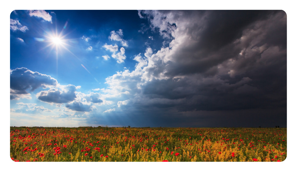
You can get all types of weather in the spring. Different types of springtime weather include rain, sun, wind, hail, sleet and snow.