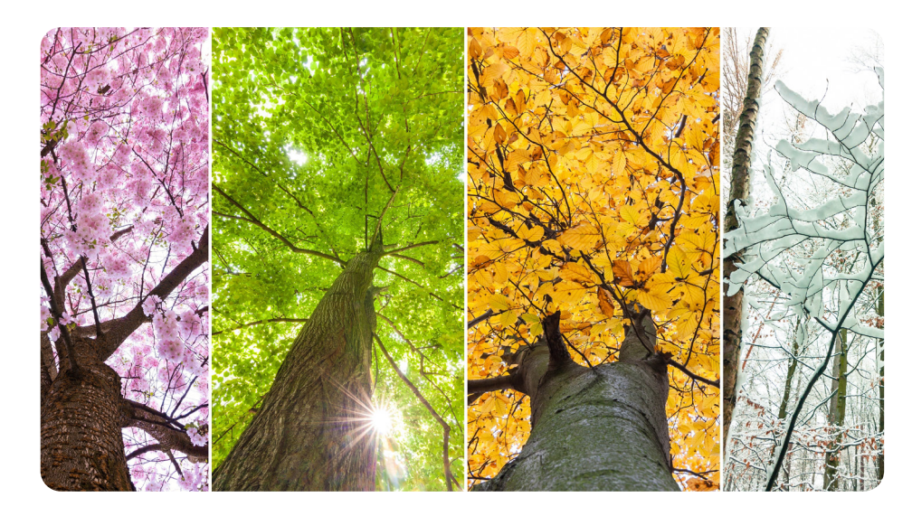
There are four seasons. They are spring, summer, autumn, and winter.