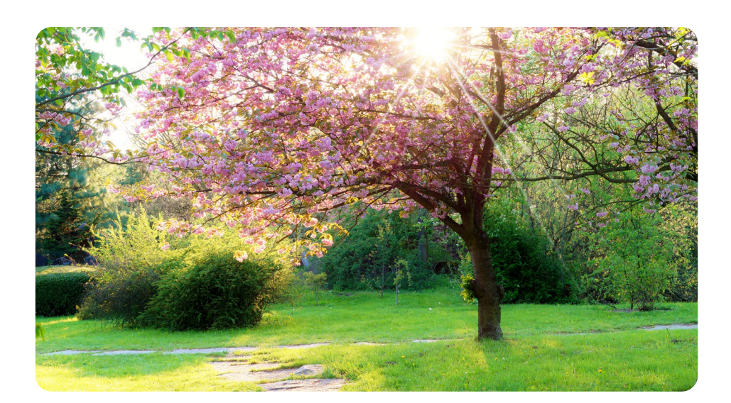
Spring is a season.

Read these interesting facts about spring and colours with a parent, carer or teacher.