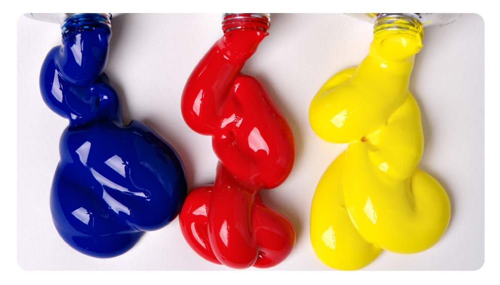
There are lots of different colours. Blue, red and yellow are called primary colours.