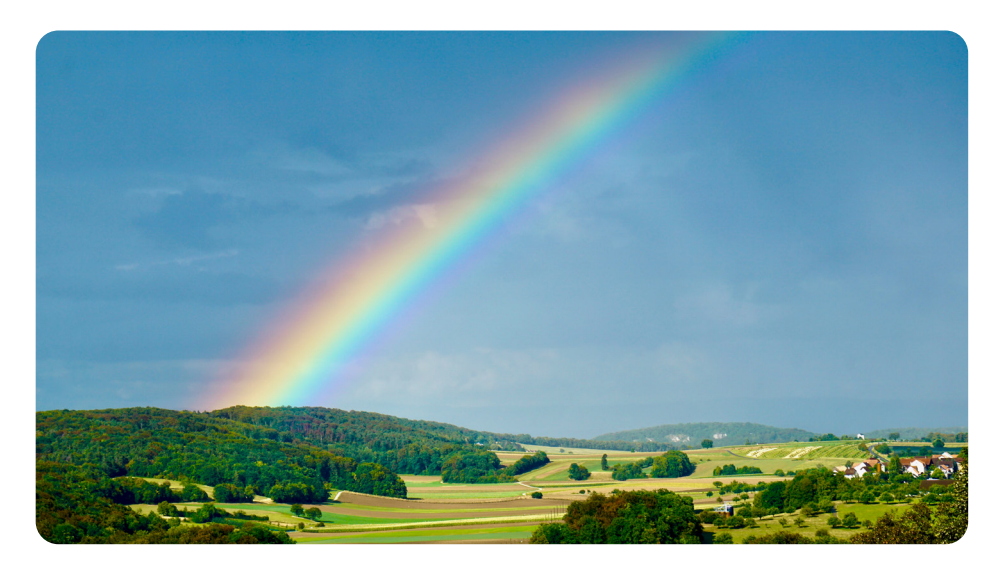
Rainbows can appear in the sky when it is sunny and rainy at the same time.