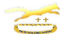
The Sir John Colfox Academy